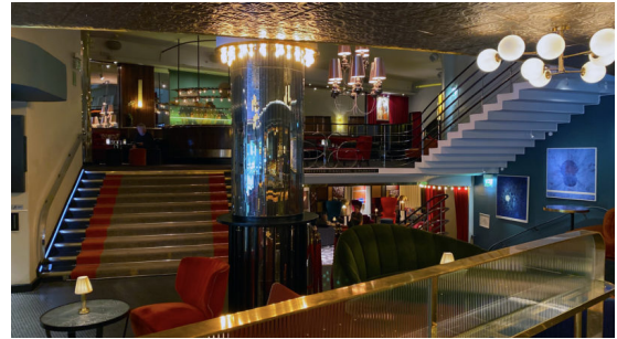
In 2019, from exactly the same angle.