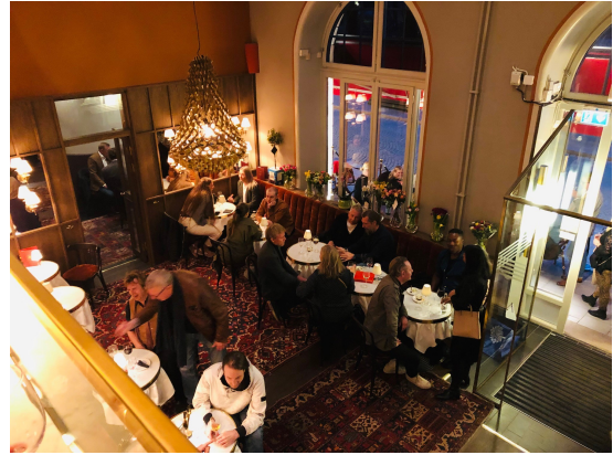
In 2022 Tavernan – new direction, new concept – a food café in a new style... and with a flair for wall lamps! Outdoor seating area open spring and summer.