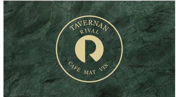
The Tavern with café, exciting lunch and dinner dishes with strong influences from Italy, among others.