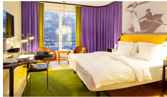
De luxe room