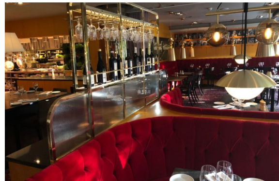
The velvet theme from the hotel rooms continues at the Rival's Bistro.

• Italian armchairs and chairs mixed with specially designed sofas. Lamps by Jamie Hayón (Spain), Rubn (Sweden) and Bover Barcelona (Spain).