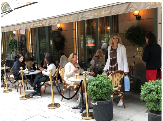
In 2021, the outside seating area of Watson's Bar expands threefold.