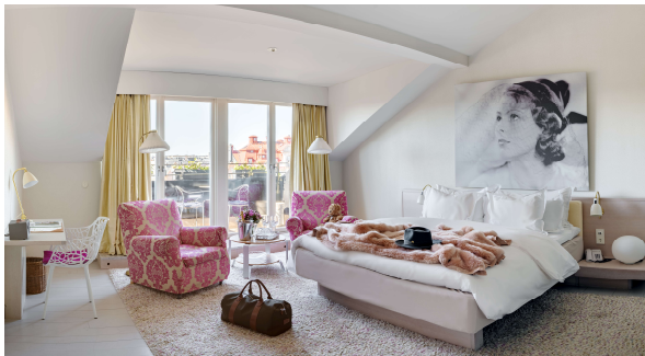
Executive 705 with a terrace