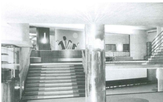
Photo of the interior from 1937. The beautifully carved railings, mirror-clad columns. On the left, the SF box office.