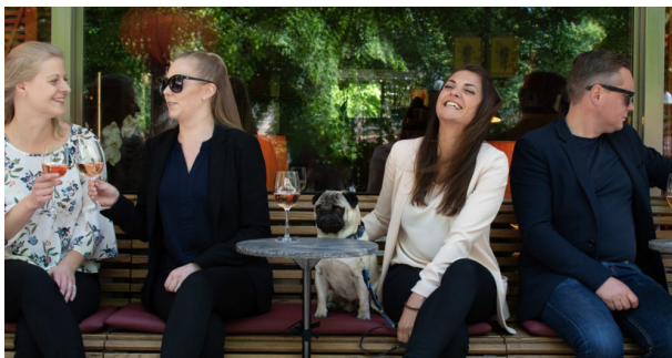
Watson's Bar outdoor seating open April-September.