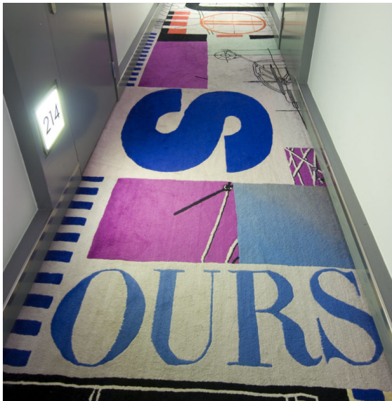
The carpets in the hallways are designed by Carouscha Streijffert, who drew inspiration from her travels and adventures around the world.

The hotel has 7 floors accessible via stairwells and elevators.