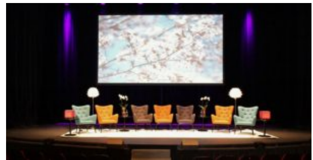
Lectures, streaming - the theatre at the Rival has 735 seats.