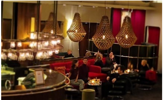
In 2020, the Cocktail Bar is given a more atmospheric lighting. Three large "Crown" lamps, design Grietje Schepers.