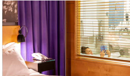
Most bathrooms have a window with a Venetian blind towards the rest of the hotel room.

The innermost wall of the bathroom is clad in glass mosaics in different colours. Kolmårds marble in patterns on the floor. Ambient lighting featuring light pillars with patterned sand-blasted glass on either side of a large mirror. Marble-clad bathtubs in all deluxe rooms and suites. Ambiance enhancing details such as coloured knobs and towel racks.