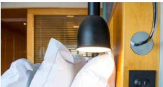
In 2013, 200 bedside lights were replaced with a more energy-efficient version of the Best Lite lamp. In 2015, each bed boasted 6 pillows instead of 4.