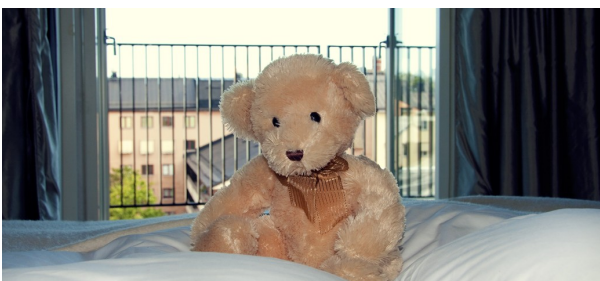
The Rival teddy – lives in all our rooms...