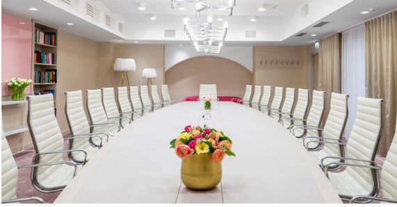
Maria conference room, for 22 people.