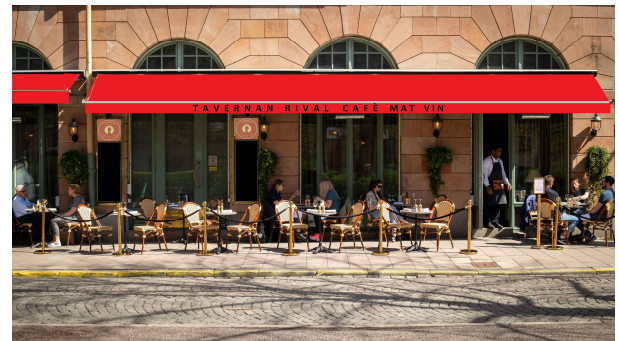
The Tavern's sidewalk seating bang in the middle of Mariatorget's buzz.