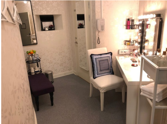
In 2019, the small stage dressing room was renovated.