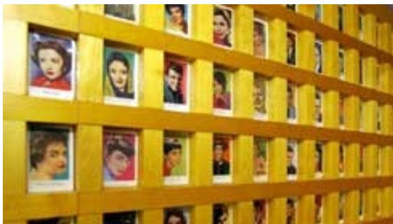
Carouschka Streiffert designed the wall panel with 924 "film stars".