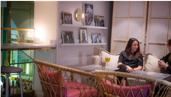
In 2013, a new serving counter and kitchen were built in Café Rival. In 2018, the update continued with a careful renovation of guest areas.