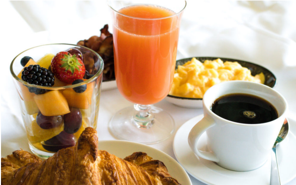
Breakfast buffet and an à la carte menu for ordering hot dishes are always included at no extra cost. Generous opening hours.