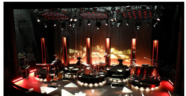
Shows, theatre, concerts, live-pods - 735 seats.