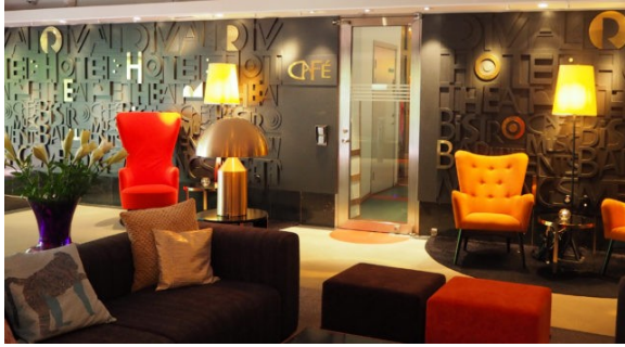
In 2016, the entrance foyer took on a new guise, making way for Watson's Bar.