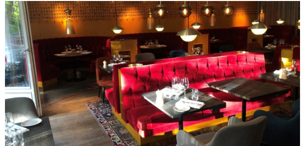
Rival's Bistro where hotel guests and Stockholmers get together.