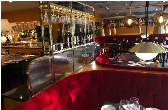
2020 marked the renovation of the Rival's Bistro. More velvet sofas, more comfy armchairs, and warmer lighting.