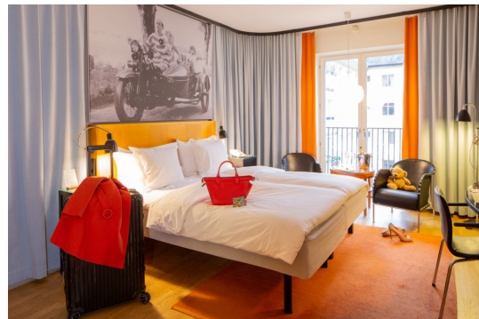
The rooms' different movie motifs from SF films are matched to the various colour schemes of the rooms, often in bold colours.

The innermost wall of the bathroom is clad in glass mosaics in different colours. Kolmårds marble in patterns on the floor. Ambient lighting featuring light pillars with patterned sand-blasted glass on either side of a large mirror. Marble-clad bathtubs in all deluxe rooms and suites. Ambiance enhancing details such as coloured knobs and towel racks.