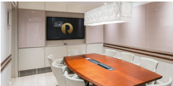
Boardroom, for 8 people.