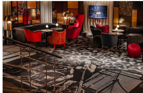
Tom Dixon and Mats Theselius.