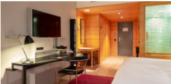
2013 marked the shift from LCD TVs and DVD players to SMART TVs and Blue-Ray players.