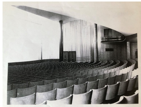
The Rival's cinema in 1937 with 1218 seats.