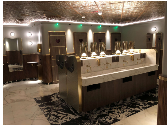
2023 A brand new restroom with 8 toilets and renovation of 2 more restroom for Rival's guests.