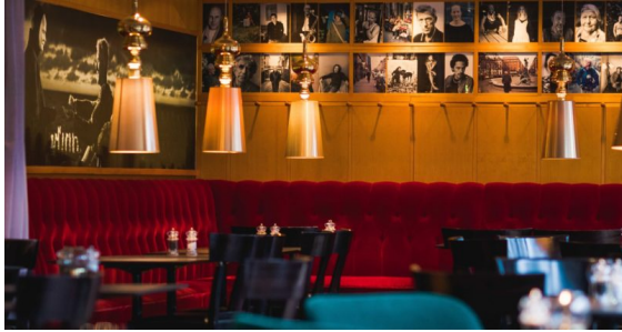
Fantastic photographs by Ulla Montan of renowned culture personalities in Södermalm.