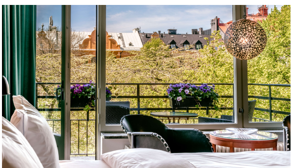
De luxe room with a balcony