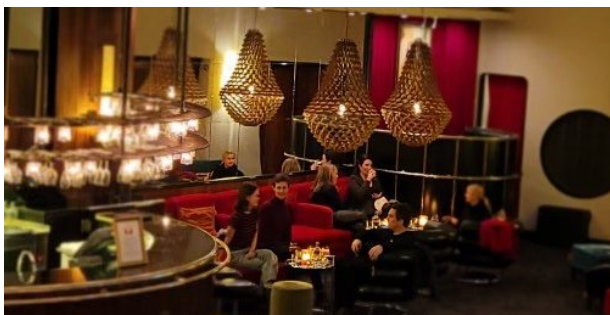
Cocktail Bar - a classic bar rich in art deco details.