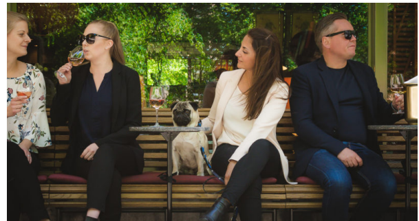
In 2019, the outside seating area of Watson's Bar opens.