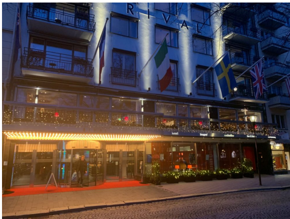
In 2018, three powerful pillars of light illuminate the Rival's façade.