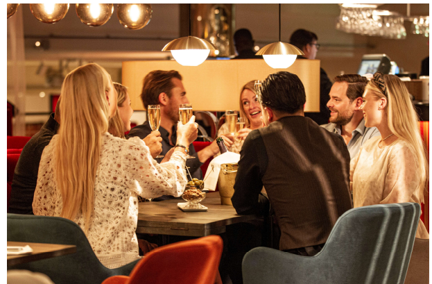
Rival's Bistro offers a wide menu of both classic and new seasonal combinations. An extensive wine list complements the meal.