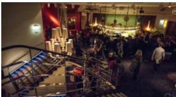
The Cocktail Bar with the original bar counter (outer part) – in the foreground Jaime Hayón's pendant light "Josephine 6.3".