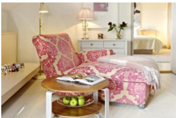
On the seventh floor, suite 704, and in the background a glimpse of Executive 705.

The top floor – the seventh floor – is characterized by light as well as the feeling that you are actually in an attic; elegance under the rooftops!