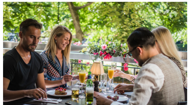
The Bistro balcony