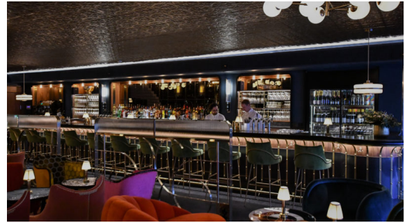
In 2019, Watson's Bar opened in the entrance level and lower foyer.