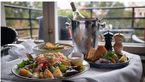
Room service around the clock. What's more, a well-stocked minibar in all rooms.