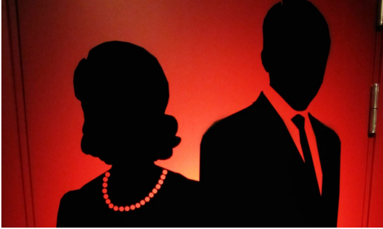
In 2012, "Mad Men" inspired the door paintings.