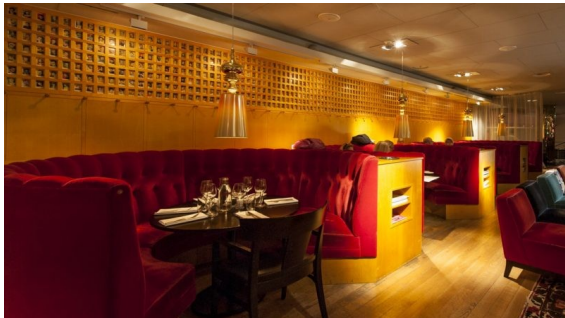
Rival's Bistro with its characteristic curved velvet sofas.