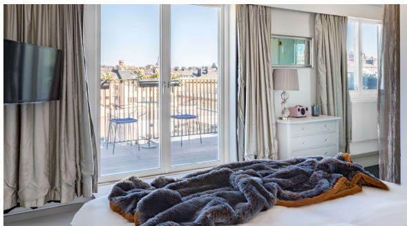
Suite 706 with a large terrace