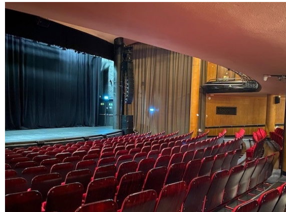
The Rival's theatre in 2022 with 735 seats.