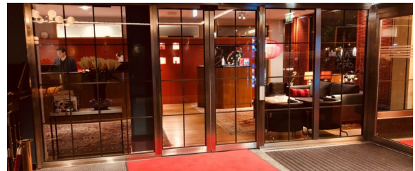
In 2019, the reception area is rebuilt, creating a more welcoming environment.