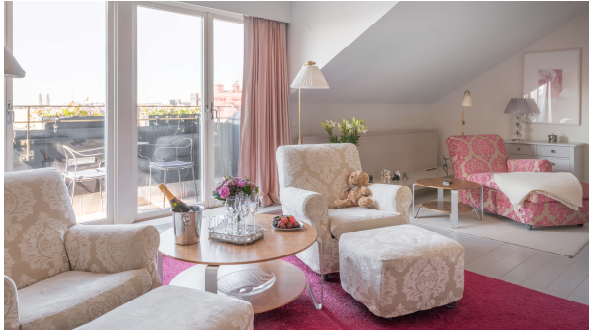
Suite 704 with a terrace