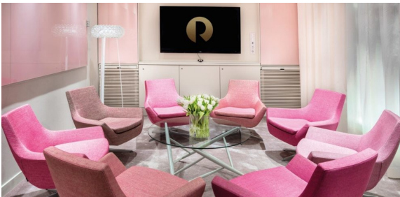
Creative room, for 8 creatives.