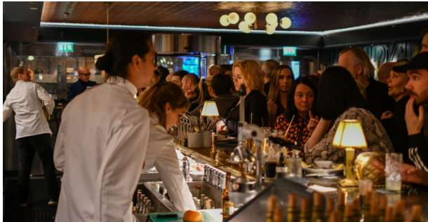
Watson's Bar is open all year long, 365 days and evenings, no exception. Music, drinks, food, after work and outdoor seating and service.