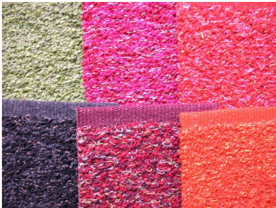
The hotel rooms have wooden floors and at least one Kasthall "Esther" rug in different colours depending on the colour scheme of the other textiles in the room.