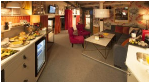
In 2019, the backstage area of the Main stage was renovated, now offering everything from sleeping compartments to showers and toilets. Add to that a buffet counter and kitchenette, make-up table, generous storage areas. Interior design and project management Adolfsson & Partners.