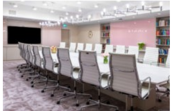
In 2015, all conference rooms were renovated. The Maria conference room ( above ), accommodates 22 people, Eames chairs, high tech, and a sober interior.