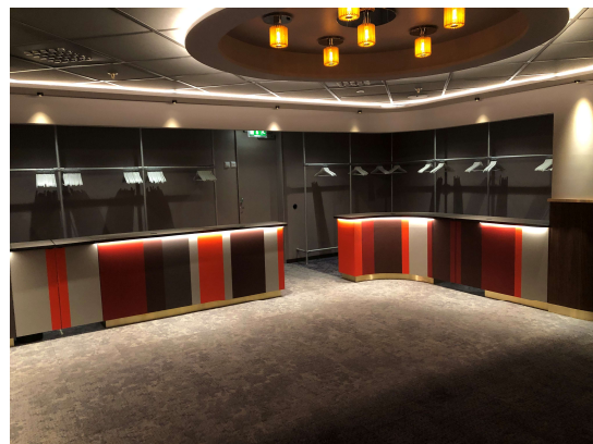
2023 A new permanent guest wardrobe is ready to take care of the guests' outerwear all show nights.