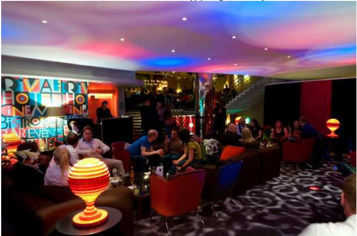
Benny Andersson: The Rival Hotel Stockholm

Take a chance on the Hotel Rival and you won't be disappointed. Abba star Benny Andersson opened the dazzling 99-room hotel in 2003 in the trendy Sodermalm area of Stockholm. The movie Mamma Mia! had its Swedish premiere at the hotel's cinema. With a bistro, cocktail bar in art deco style, café and lounge with seating for 700, it's the perfect place to discover your inner Dancing Queen.