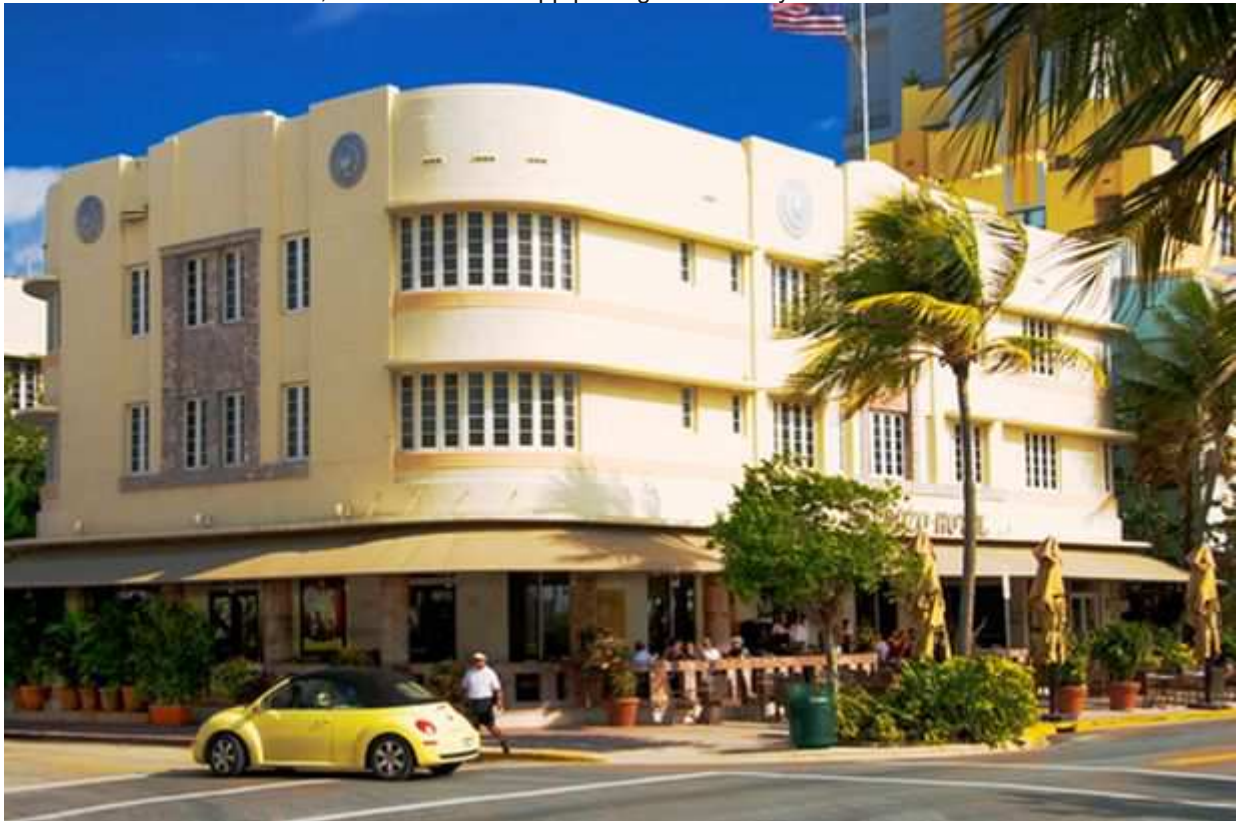
Gloria Estefan: Cardozo Hotel, Miami

The undisputed queen of Latin music Gloria Estefan owns this elegant, chic, and sophisticated hotel in Miami with her husband Emilio. Described as an art deco jewel, the Cardozo Hotel is perfectly located over the road from the sands of South Beach and within easy walking distance of Miami's best restaurants and nightclubs.