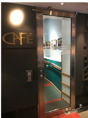
Indoor entrance to Café Rival