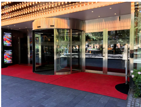
Hotel Rival's entrance and revolving door