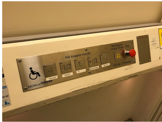
Elevator control panel at accessible height. Access till theatre, Rivalen, bars and bistro