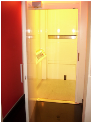
Disability accessible elevator w/ automatic door opening