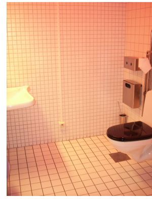
Disability accessible restroom at entrance level