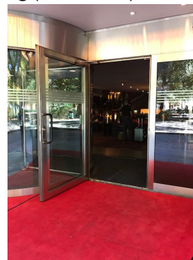
2. Side door automatically opens (108cm wide)