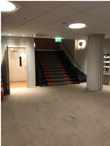
Elevator down to the Rivalen