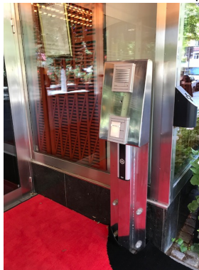
1. Press button