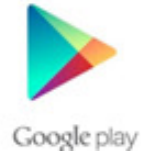
Download via Apple/Google