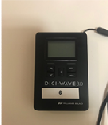
Necklooper Telecoil Coupler