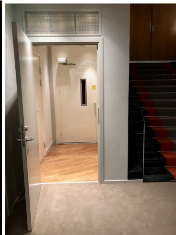
Elevator to bar and restaurant