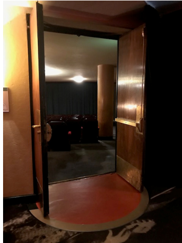
Entrance to theatre