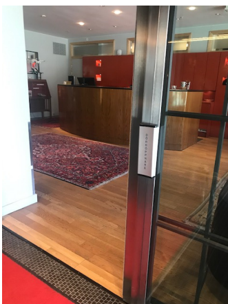
Entrance to reception